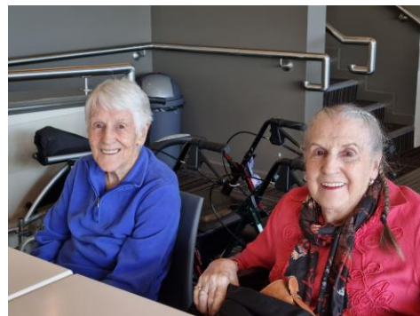
Enjoying an afternoon at the Pinjarra Trots